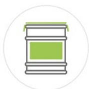
30 Kg DRUM