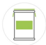
230 Kg DRUM